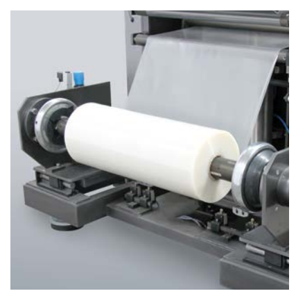
Roll unwinding assembly