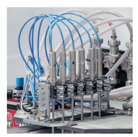
Close-up of filling tubes