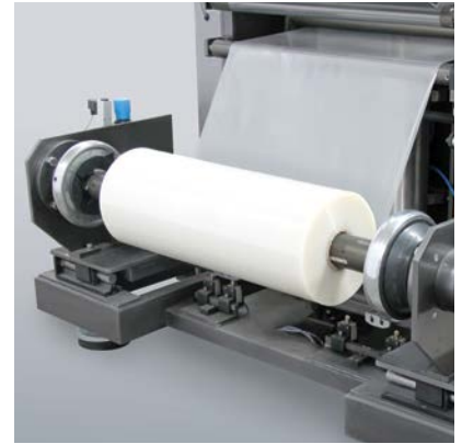
Roll unwinding assembly